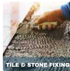
TILE & STONE FIXING