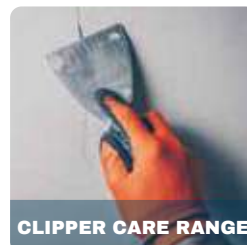
CLIPPER CARE RANGE